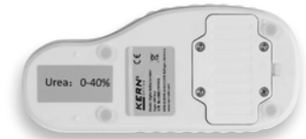
Rear view, screw-on battery compartment cover