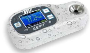
IP65: Protected against dust and water splashes