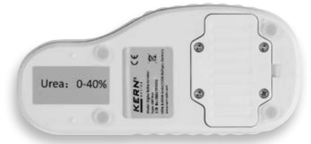
Rear view, screw-on battery compartment cover