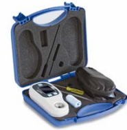
Transport and storage case